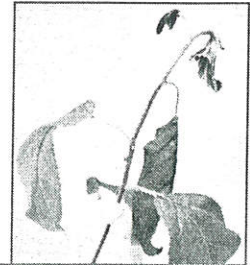
Fig. 1 : Symptom of necrosis caused by Erwinia amylovora on the stem of an apple shoot.

F ire blight, caused by the necrogenic gram negative bacteria Erwinia amylovora , is one of the most destructive diseases of apple ( Malus x domestica ) and pear ( Pyrus communis ) worldwide (Fig. 1). Using genetically resistant cultivars could be an alternative to chemical fight. The objective of this study was to identify the genetic determinism underlying resistance to fire blight in two apple progenies.