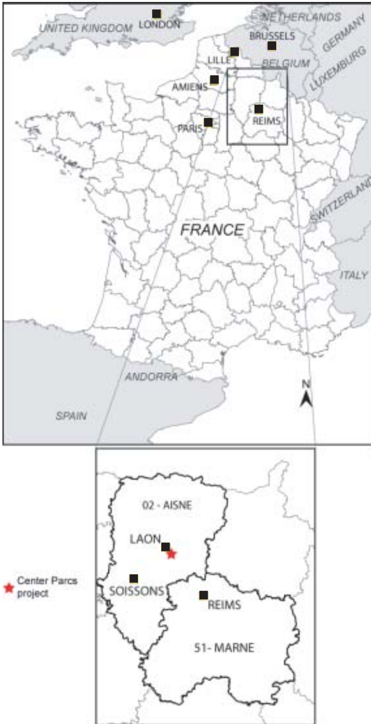
Figure 1. Location of Center Parcs–Aisne resort in Europe.