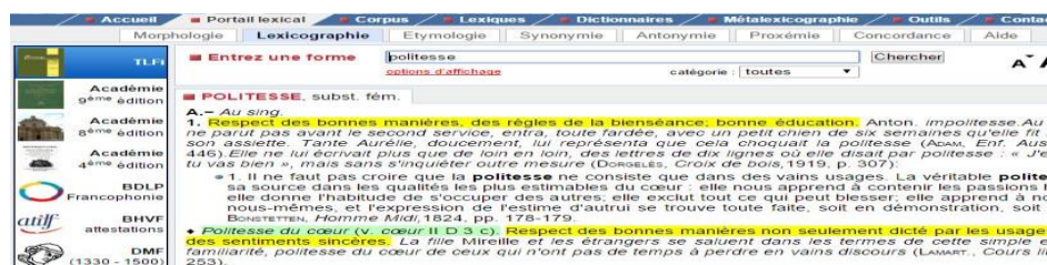
(Figure 2 : TLFi : An extract of the TLFi article dealing with the lexeme {Politesse})

The TLFi article on the simple French lexeme {Politesse} 6 (Figure 1) is composed of three main parts: the first two parts (noted respectively "A" and "B") are reserved for definitions and a series of examples of the reference lexeme. The third part brings together a set of miscellaneous information about the pronunciation and orthography of the lexeme, its etymology, its history, the frequency of its manifestation in the TLFi corpus, etc.