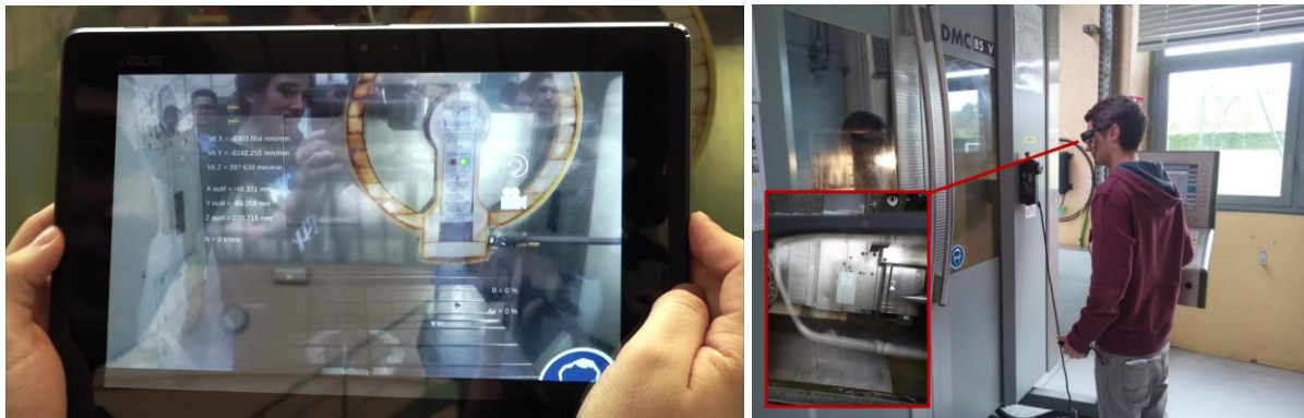
Fig. 2. AR system in operation (on the left: using a tablet PC; on the right: using AR glasses with a zoom on displayed information)

The user first selects the machine tool he wants to use in the database then his profile. Note that he can also create a new profile in the database with customized parameters for the visualization of information. Then he places the AR device in front of the machine window. When starting a machining process, the user can see through the device the machine window with information from the machine tool (figure 2). To display the 3D representation of the cutting tool motion at the right position (the position of the arrow must match the one of the cutting tool), AR markers have to be placed on the machine tool to detect the position of the AR device with regard to the one of the cutting tool. Recognition is done using Vuforia SDK.