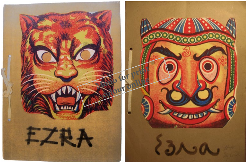
Figure 3. Two covers of ezra 4 (Mehrotra 1968). Mehrotra bought these paper masks from a local toyshop in Allahabad and glued them to the covers, that were all different from each other.

no two copies of the magazine identical. There was also a connection with the Gujarati poets, with Kriti for instance, a Gujarati magazine which had an English section. Then in 1969 you have Vrishchik .