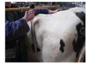
Hip Width (HW)

Indirect measurements on 3D images from 3D device (Video available at : https://vimeo.com/219370900 )