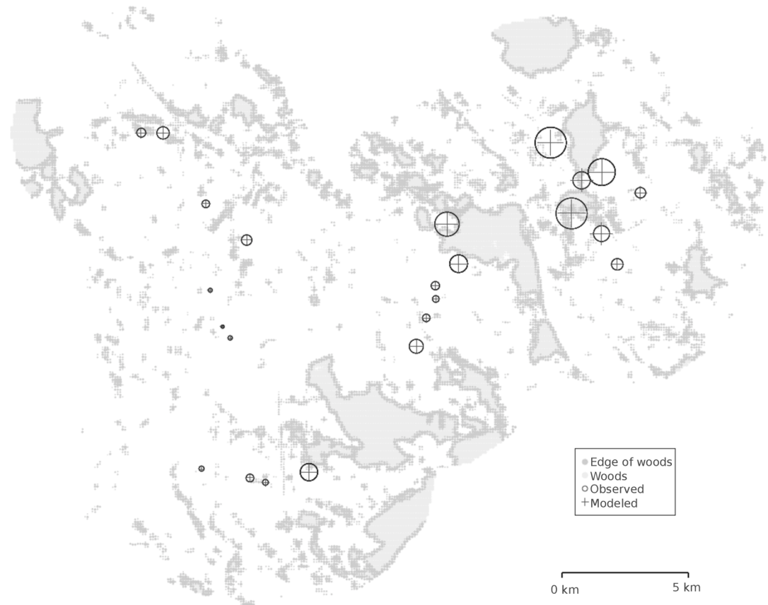
Fig 3. Abundance of pollen beetles observed (circle) and calculated (cross) by the model structured by site and in the context of the surrounding woodlands. Cross and circle sizes were proportional to pollen beetle abundance per 10 plants x 5 points x 4 observations. The surface of the wood area points (edge and core) was proportional to the area of woods in the pixel, with the maximum diameter equal to the pixel width and corresponding to 1ha.

https://doi.org/10.1371/journal.pone.0183878.g003