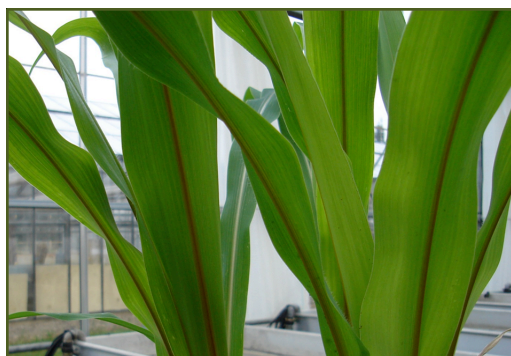
Figure 1 - Brown-midrib line F7803bm1

Two other brown-midrib mutations were shown to alter genes involved in metabolisms occurring upstream phenylpropanoid and monolignol pathways. The bm2 mutation, located on maize chromosome 1 (bin 1.11), affect a methylenetetrahydrofolate reduc-