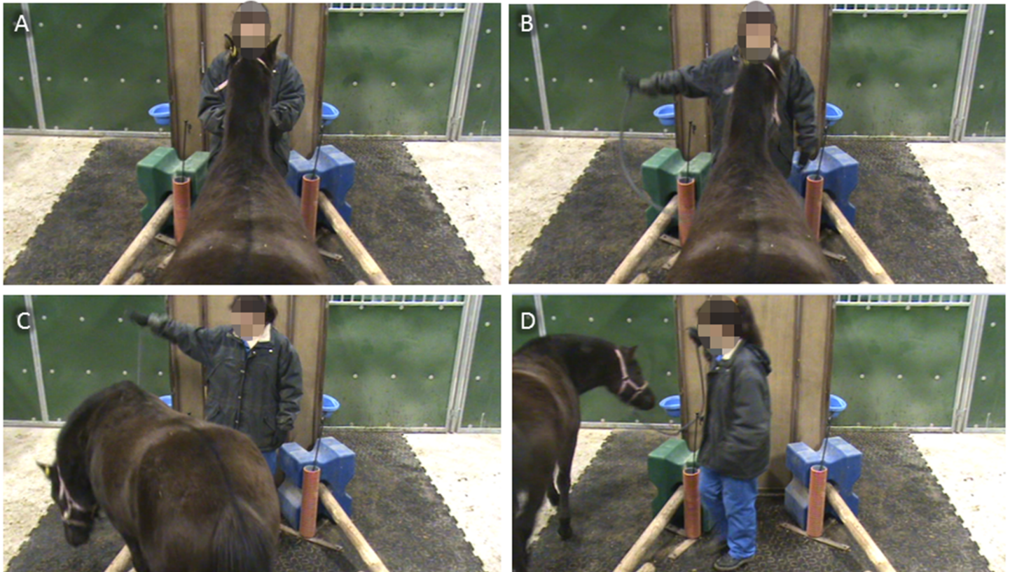
Fig 2. Sequential screenshots of a typical learning trial from a high-angle point of view. (A) Horse is ready in the starting position. (B) Experimenter is giving stage 1 indication toward the left compartment. (C) Horse is entering the left compartment. (D) Horse has successfully entered the left compartment and is going to receive food reward in the left bucket.

https://doi.org/10.1371/journal.pone.0170783.g002