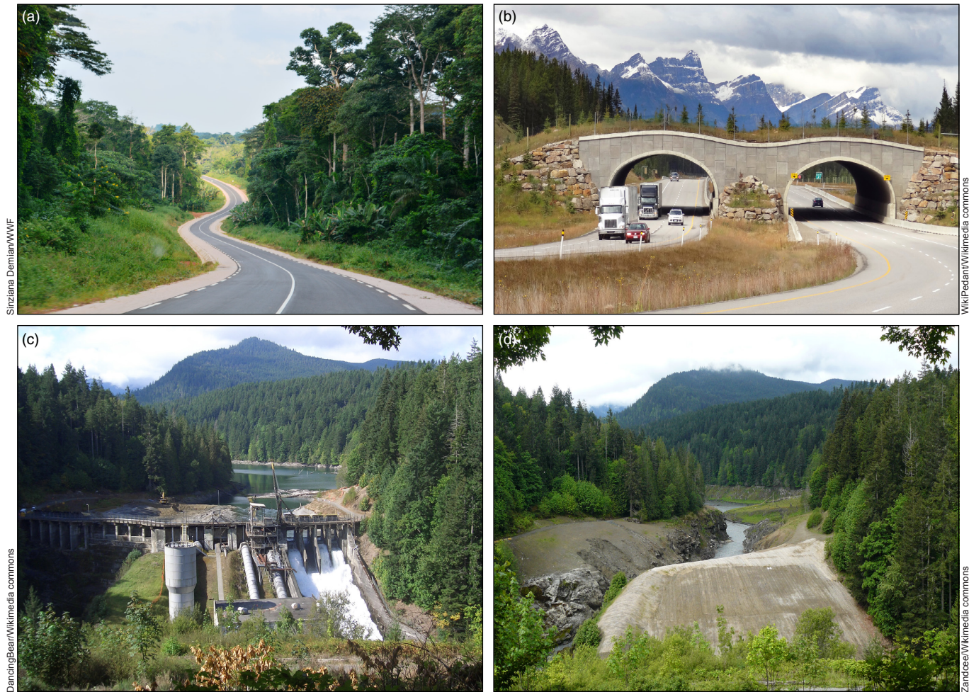
Figure 2. Examples of dynamic barriers and associated management options. Road building (a) is a ubiquitous example of dispersal barriers threatening biodiversity, particularly in tropical forests as illustrated by this recent highway, constructed in the heart of the Congo Basin rainforest. Wildlife crossings (b) and other corridors are often proposed to recover connectivity between habitat areas. In Canada, the Elwha River dam (c), which negatively affected ecological processes (including fish dispersal), was removed in 2011 (d).

(see review by Sorte 2013). In particular, long-distance airborne introduction of new species can be determined by unusual weather events, such as strong winds (de la Giroday et al. 2012). Climate affects water movement and therefore barriers to dispersal in aquatic ecosystems, both vertically (eg via stratification) and horizontally (eg currents, eddies, fronts). Retreating glaciers and melting sea-ice open new habitats and dispersal pathways, by removing barriers that are acting at the transience or settlement stages (Clarke et al. 2005).