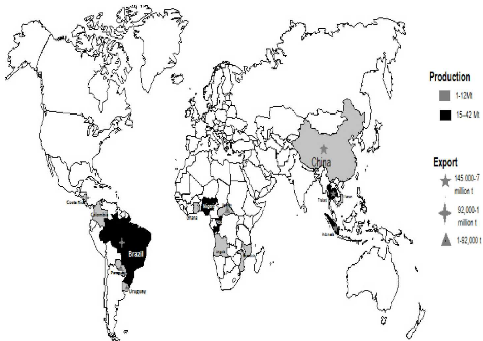
Figure 1 Cassava production and exportation flux in the world

Notes: Africa is the first cassava producer with in order: Nigeria, Democratic Republic of Congo, Angola, Ghana and Mozambique. Asia is in second ringed with: Thailand, Indonesia, Vietnam, China and India. The third position is occupied by America Caribbean: Brazil, Paraguay and Colombia. Other low producers are also encountered on the continents mentioned above.