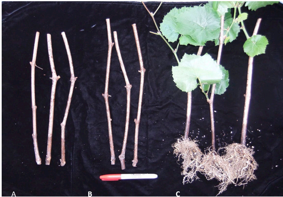
Figure 1. Effects of hot-water treatment on root development and bud burst of rootstock canes (variety 5C). Treatments were: (A) 53°C-30 min; (B) 53°C-60 min; (C) control canes with no HWT.