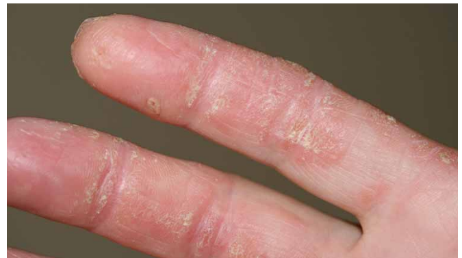
FIGURE 3 Mechanic's hands in a patient with anti-MAD5 positive dermatomyositis.

Aside from recent advances in patients with anti-MDA5 autoantibodies, the pathogenesis of dermatomyositis- or polymyositis-related ILD is poorly known, contrary to that of SSc [67]. Immunohistochemistry on muscle biopsy provides some clues as to immune mediated mechanisms. CD8 + T-cells are usually found in polymyositis with a diffuse cytotoxic effect leading to muscle cell necrosis [68], whereas B-cells and CD4 + T-cells predominate in perivascular areas in dermatomyositis and may be responsible for muscular vasculitis [67, 69]. In lung biopsy specimens of patients suffering from dermatomyositis- or polymyositis-associated ILD, numerous activated CD8 + lymphocytes are found in both