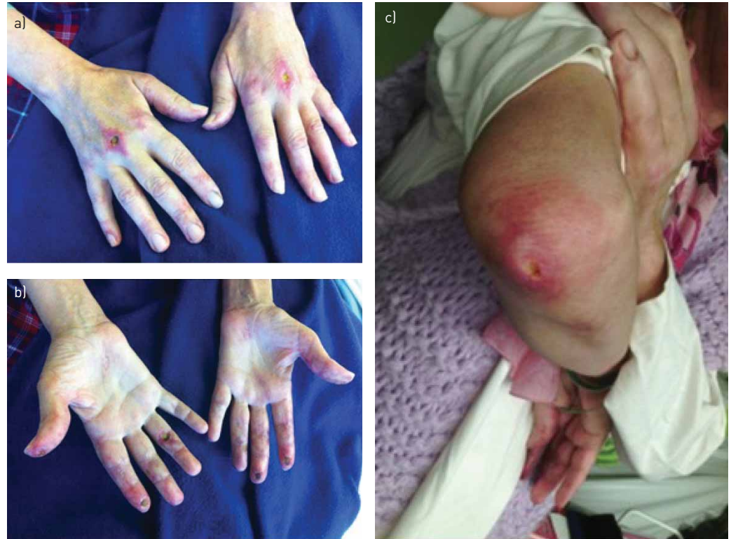
FIGURE 2 Clinical features associated with anti-MDA5 autoantibodies include severe cutaneous ulcers of a, b) the fingers and c) the dorsal side of the elbow.

sensitivity of 77% and a specificity of 86% in a meta-analysis of 631 dermatomyositis or polymyositis patients [64, 65]. Fulminant presentations with ILD, CADM and anti-MDA-5 autoantibodies may be especially frequent in Japanese patients compared with other east Asian or non-Asian patients [35, 64], although a publication bias cannot be excluded. In a Japanese retrospective series of 54 patients with JDM [66], 10 had rapidly progressive ILD and 19 had chronic ILD, illustrating the particularly frequent pulmonary involvement in the Asian population.