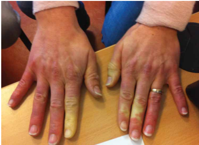
FIGURE 1 Raynaud's phenomenon in a patient positive for anti-PL7 antibodies.

The clinical features described in patients with anti-PM/Scl antibodies largely overlap with those in patients with anti-ARS autoantibodies [19, 32]. Indeed, anti-PM/Scl positive patients commonly experience arthralgia (74%), Raynaud's phenomenon (63%), ILD (38%), fever (33%) and mechanic's hands (11%) [8]. Cutaneous manifestations of dermatomyositis and sclerodactyly are reported in 49% and 76% of cases, respectively [8]. The rash is usually mild and transient, with isolated heliotrope rash or Gottron's papules [11].