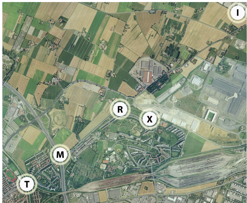
Fig. 1 Location of the experimental garden (X) in respect to main pollution sources, namely the city incinerator (I), via San Donato (R), A14 motorway (M) and main railway (T)

Plants were grown either on the allotment soil or onto elevated beds filled with commercial soil (Geotec, RO, Italy). Growing containers were built according to Orsini et al. (2014), using recycled pallets and black plastic films. The declared physical and biochemical features of commercial soil were organic carbon 25 %, organic nitrogen 1 %, peat 60 % and salinity 0.6 dS m -1 .