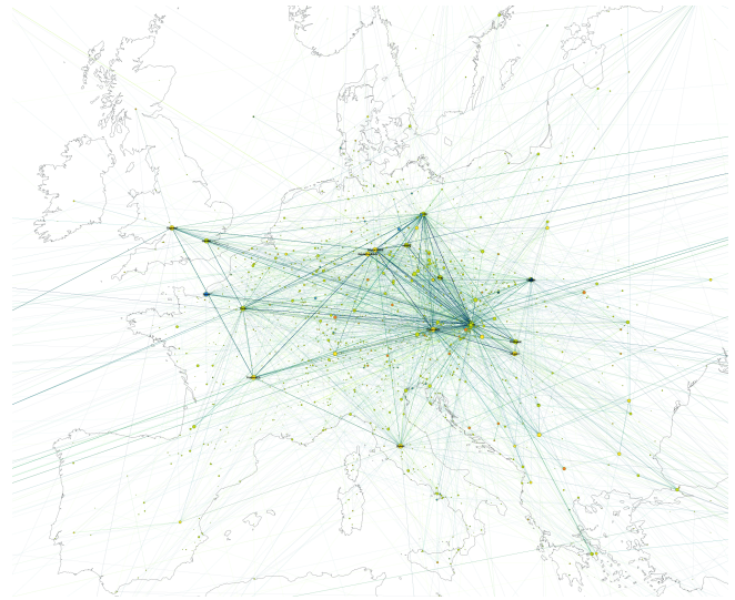
Figure 2. Refined analysis (size proportional to corpus frequency; yellow: sovereign territories; orange: regions; green: populated places; blue: geographical features; time axis represented by a gradient from light green to dark blue)

linking surfaces without tampering with map readability. Coastlines are depicted in gray to give a sense of orientation, no boundaries are drawn, as they are of a changing nature and may superimpose an artificial reading of the map (Smith 2005).