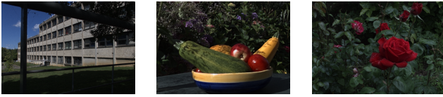
Fig. 3: Light Fields used in the tests: “Building”, “Fruits” and “Rose”. All of the three are captured by Lytro Illum camera and demultiplexed by Lytro Power Tools Beta software.