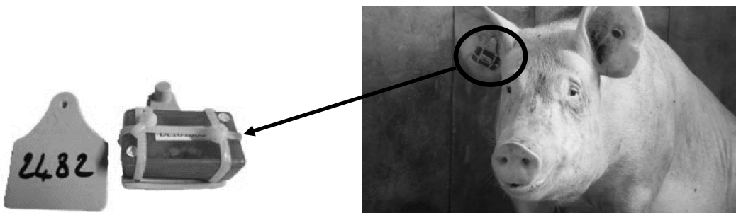
Figure 2: Location of the experimental prototype accelerometer

In order to synchronise accelerometer data with video recording, the operator rotated the sensor three times in front of one of the five cameras before attaching it to the animal.