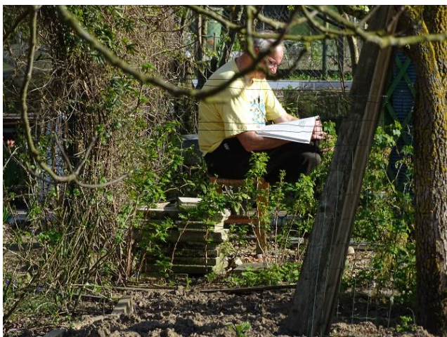
Photo 13. A gardener reading in its garden