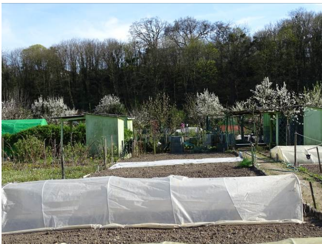
Photo 1. Some allotment gardens in Bergeonnerie spot (shot: A. Robert, 2015)

Among the 52 urban green spaces, we selected six ones to conduct a more in-depth study. Here, we focus on allotment gardens and thus on the case of this category we studied: the Bergeonnerie allotments, which are located in Tours, a medium town (136 125 inhabitants in 2014) in the west part of the region Centre-Val de Loire (fig. 1). The Bergeonnerie allotments are in the southern part of the city, close to another garden, an ornamental one – the Bergeonnerie park – (fig. 2). The spot includes 511 gardens, each one having an area of 20m 2 and being separated from the others by wire fencing (photo 1). These plots are rented by users to the municipality, through three associations, who manage the area. Focusing on this kind of garden, our purpose is to question some ecosystem services the allotments offer, compared with other gardens, to know if they are urban green spaces like others, especially if they offer cultural services. Indeed, it is now well-known that urban green spaces contribute to the well-being of city-dwellers and to the life quality in cities. They provide many benefits ([2, 3]...) and they have a positive connotation in the city-dwellers mind [4]. A. Voigt et al. [5], who conducted their study in public parks in Berlin (Germany) and Salzburg (Austria), confirm: