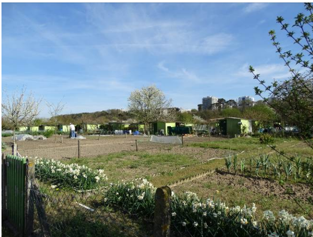
Photo 4. Flowers planted often in the front of the garden

It is obvious that allotments offer provisioning services: they are cultivated to obtain vegetables, according to different motivations. But they also provide cultural services and they thus become urban green spaces like others. Indeed, one of the first observations we had got is that allotments are also a place to walk.