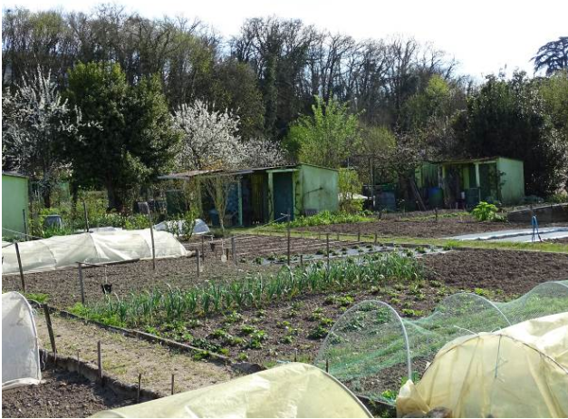
Photo 2. Garden, where vegetables are cultivated