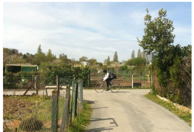
Photo 6. A cyclist crossing the Bergeonnerie allotments spot