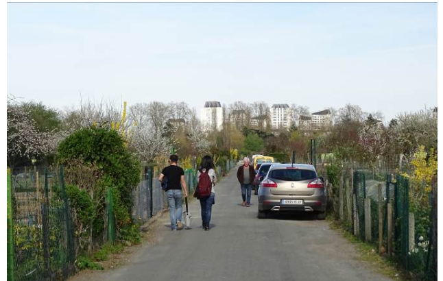
Photo 5. People walking on the way in the middle of the allotments