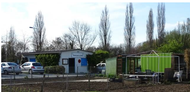
Photo 11. House of one of the three associations, which manage the spot

Beyond being a sociability place, allotment gardens are also place of education.