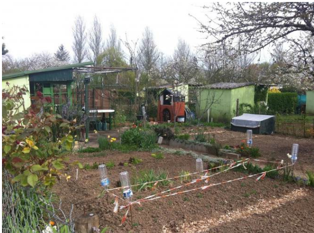
Photo 10. Indices that allotment gardens are also a place to eat: table and barbecue