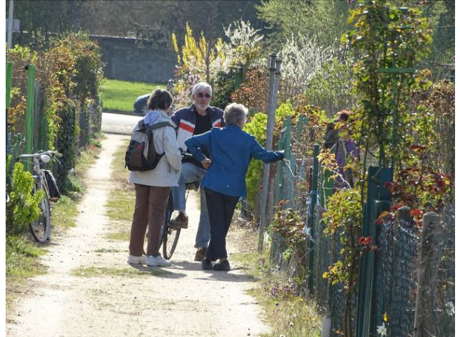
Photo 8. People stopping to speak to a gardener

Our observations confirmed the accounts of the people in charge of the management of green spaces. Indeed, we could see that some people stopped to speak to the gardeners (photo 8) and the gardeners also took times to talk together (photo 9). When we interviewed them, a large majority (87%) confirmed that allotment gardens are “a friendly place”, “a place to meet people”: “We come here for two reasons: to garden and to talk to friends”; “The neighboring gardeners are my friends”; “Sometimes we come here only to meet friends”. Some interviewed gardeners added that it is also “a place of sharing” (said by 27% of them). Indeed, they exchange seedlings and young plants (50%) and advices on the cultivation or on the cooking of vegetables (27%). During our field survey, we could see indices proving that allotments are not only places to cultivate but also places, where people come to spend time together, even eat: tables and barbecues in some gardens attest this idea (photo 10). We have also to mention that the allotment gardens of the Bergeonnerie are managed by three associations (photo 11) and these ones contribute to the social dimension of this spot.