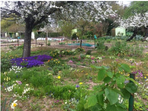
Photo 3. Garden, where flowers are planted

It is obvious that allotments offer provisioning services: they are cultivated to obtain vegetables, according to different motivations. But they also provide cultural services and they thus become urban green spaces like others. Indeed, one of the first observations we had got is that allotments are also a place to walk.