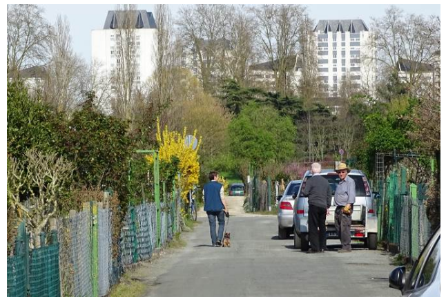
Photo 7. People going for a walk, here with a dog

During our in situ observations, we see many people on the way in the middle of the Bergeonnerie allotments. They thus come in this spot to walk, like in other urban green spaces, with different motivations. Some of them just cross the spot (photo 5): they prefer walk here than along the road, which is near the allotments. They are often students,