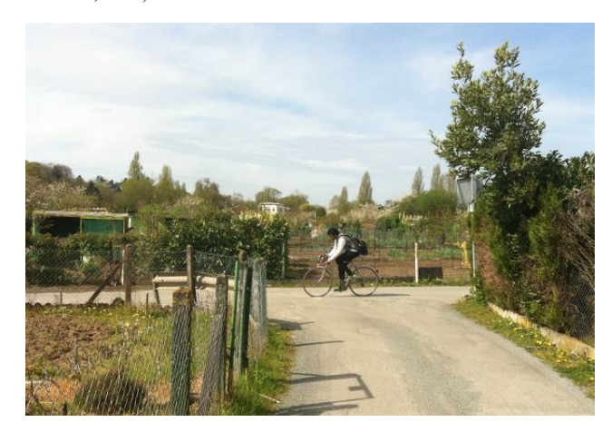
Photo 6. A cyclist crossing the Bergeonnerie allotments spot