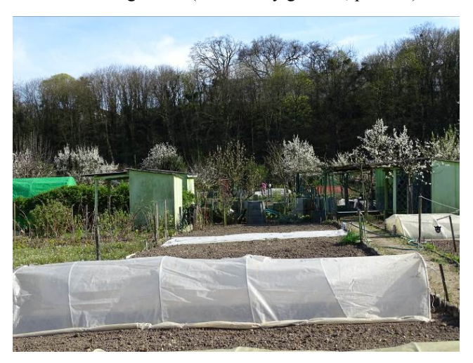
Photo 1. Some allotment gardens in Bergeonnerie spot

Among the 52 urban green spaces, we selected six ones to conduct a more in-depth study. Here, we focus on allotment gardens and thus on the case of this category we studied: the Bergeonnerie allotments, which are located in Tours, a medium town (136 125 inhabitants in 2014) in the west part of the region Centre-Val de Loire (fig. 1). The Bergeonnerie allotments are in the southern part of the city, close to another garden, an ornamental one – the Bergeonnerie park – (fig. 2). The spot includes 511 gardens, each one having an area of 20m<sup>2</sup> and being separated from the others by wire fencing (photo 1). These plots are rented by users to the municipality, through three associations, who manage the area. Focusing on this kind of garden, our purpose is to question some ecosystem services the allotments offer, compared with other gardens, to know if they are urban green spaces like others, especially if they offer cultural services. Indeed, it is now well-known that urban green spaces contribute to the well-being of city-dwellers and to the life quality in cities. They provide many benefits ([2, 3]...) and they have a positive connotation in the city-dwellers mind [4]. A. Voigt et al. [5], who conducted their study in public parks in Berlin (Germany) and Salzburg (Austria), confirm: