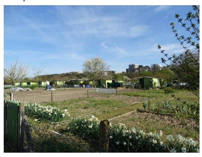
Photo 4. Flowers planted often in the front of the garden

It is obvious that allotments offer provisioning services: they are cultivated to obtain vegetables, according to different motivations. But they also provide cultural services and they thus become urban green spaces like others. Indeed, one of the first observations we had got is that allotments are also a place to walk.