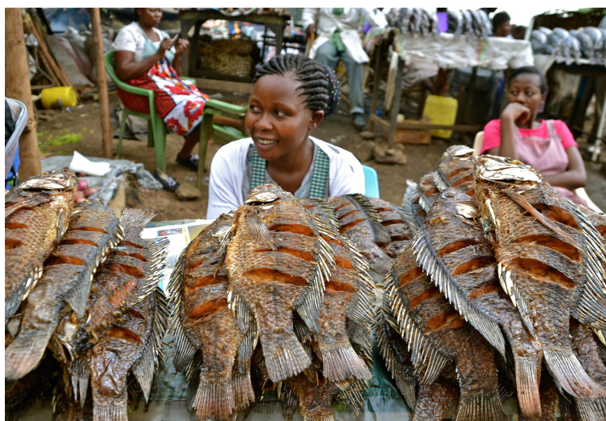
Fish seller in Western Kenya.

Enabling consumers to identify products as being produced sustainably is fundamental to incentivising farmers to market their products in this way. In this short article, we reflect upon what we know about efforts to link sustainable production with responsible consumption both within global value chains and within domestic markets in developing countries.