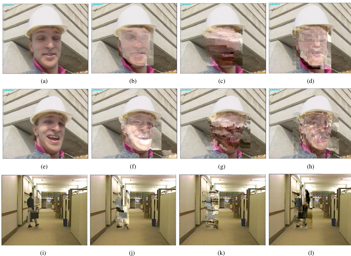
Fig. 2: With CIF size, QP= 24 and IP = 5: (a) The 1st frame of original 'foreman' (I frame), (b) encrypted by SNC, (c) encrypted by SNC+IPM, (d) encrypted by our process. (e) The 15th frame of original 'foreman' (P frame), (f) encrypted by SNC, (g) encrypted by SNC+IPM, (h) encrypted by our process. (i) The 40th frame of original 'hall' (P frame), (j) encrypted by SNC, (k) encrypted by SNC+IPM, (l) encrypted by our process.

We are evaluating the security of our process in terms of brute force and replacement attacks and we are refining the method to be robust against these attacks.