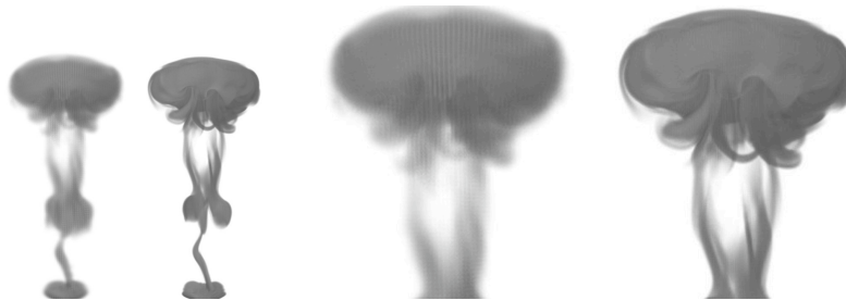
Fig. 1. Left pictures: volume rendering comparison of a low (left pictures) and high (right pictures) resolution of scalar in an under-resolved jet. The right pictures are a close-up view of the top part of the jet.

We first consider a jet at a low Reynolds number carrying a passive scalar. The Schmidt number is taken infinite. We compare two experiments. In the first one, both vorticity and scalar are under-resolved. In the second one, the vorticity is under-resolved but the scalar use a three times finer resolution. Figure 1 is a volume rendering visualization of the density for both cases. Although the second experiment takes only 20% more CPU time than the first one - due to the spatial localization of the scalar - there is a clear gain, at least from a qualitative point of view, in the visualization of the intermediate scales.