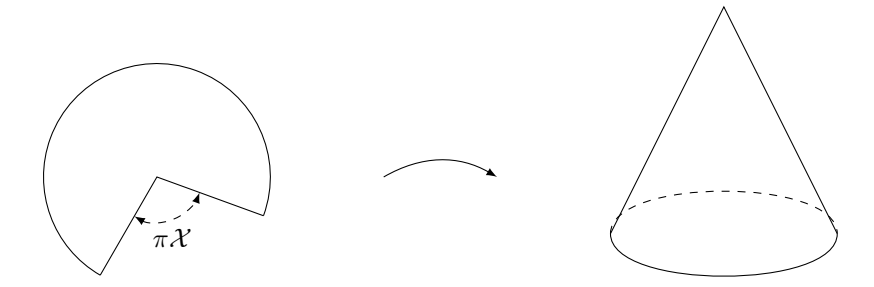
Figure 3: Cone with deficit angle \pi \mathcal{X} . Glue isometrically the two boundary segments of the left-hand side figure to get the cone of the right-hand side figure. Such a cone is isometric to the complex plane equipped with the metric ds^2 = |z|^{-\mathcal{X}} dz d\bar{z} .

This equation appears when one looks for a metric with prescribed negative curvature 8\pi^2\Lambda and conical singularities at the points z_1, \ldots, z_p (see Figure 2). Each source \mathcal{X}_i\delta_{z_i} creates a singularity with shape \sim \frac{1}{|x-z_i|^{\mathcal{X}_i}} in the metric e^{U(x)}\hat{g} . Such singularities are called conical as they are locally isometric to a cone with "deficit angle" \pi\mathcal{X}_i (see Figure 3).