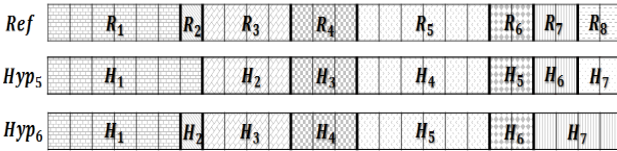
Figure 3: Penalization of missing errors

Let's now consider the errors of Fig.3. For the two reference segments R_i and R_j , the system proposes only one segment H_k . In some cases, the measure CovN is less sensitive to non-detected small segments when the neighbors segments are correct.