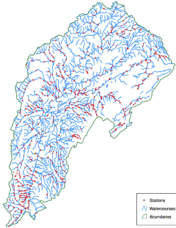
Figure 1: The Saône river watershed.