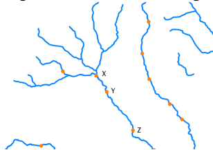
Figure 3: watercourse zoning.