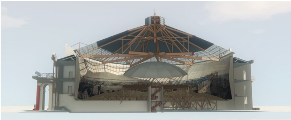
Fig. 01. Panorama section

what is now called the Dutch Golden Age (17th century). Painters like Jan van Goyen introduced the “ tonal ” style picturing wide cloudy skies, windy atmosphere, and contrasted lights. The first Dutch paintings were quite small, but canvas became wider and wider when entering the 18 th then the 19 th century. Besides the artistic exploration of the landscape, started in France a topographic investigation with the Cassini family. Panoramic views were then tested with topography to give a synoptic representation of a map and the landscape around. Horace Benedict de Saussure drew a circular view from the summit of the Glacier de Buet in 1776 with a map in the middle. This image foreshadows the so-called “ little planet ” that we do now with a 360 camera. Panoramic views were also used for military purposes, very much like a 3D map. In 1915, Henry Valensy drew the panorama of the Dardanelles in two versions, a water coloured and inked version with comments. The two maps, used together, strongly recall digital maps services that we are using nowadays with a coloured satellite view and a raster view with texts.