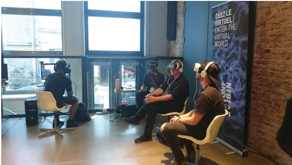
Fig. 04. virtual panoramas

In Pokémon GO the players must catch virtual creatures revealed in augmented reality through a smartphone. This innocent quest transformed the reality. Many places are now forbidden to the gamers, inattentive driving is now detected by the game warning the players. Massive gathering in some location transform neighbourhoods’ life and rhythm. Forbidden or secret places become suddenly famous and populated.