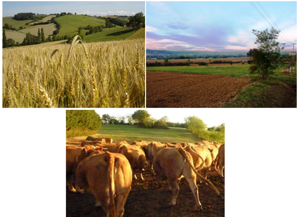
Fig. 1 Diversified and integrated crop–livestock systems in Gascony, southwestern France, that incorporate crop fields, grasslands, grazing animals, hedgerows, and woodlots. The ecological and patrimonial value of such systems is threatened by agricultural specialization and intensification, resulting in abandonment of less productive areas and homogenization and simplification of land use in productive fields.

especially in areas dominated by large farm units (Peyraud et al. 2014). Integrated crop–livestock farmers abandon animal production for several reasons: (i) costs of energy and mineral fertilizer for specialized cereal cropping increase more slowly than costs of labor required for animal production (Peyraud et al. 2014); (ii) workload simplification and control (especially by eliminating milking and calving) (Bell and Moore 2012; Bell et al. 2014; Doole et al. 2009; Sulc and Tracy 2007); (iii) changing regulations, such as norms on livestock buildings, make upgrading farms prohibitively expensive (Peyraud et al. 2014); and (iv) disappearance of supply chains that process and sell animal products (e.g., concentration of milk industries in specialized regions, disappearance of small slaughterhouses) (Moraine et al. 2014).