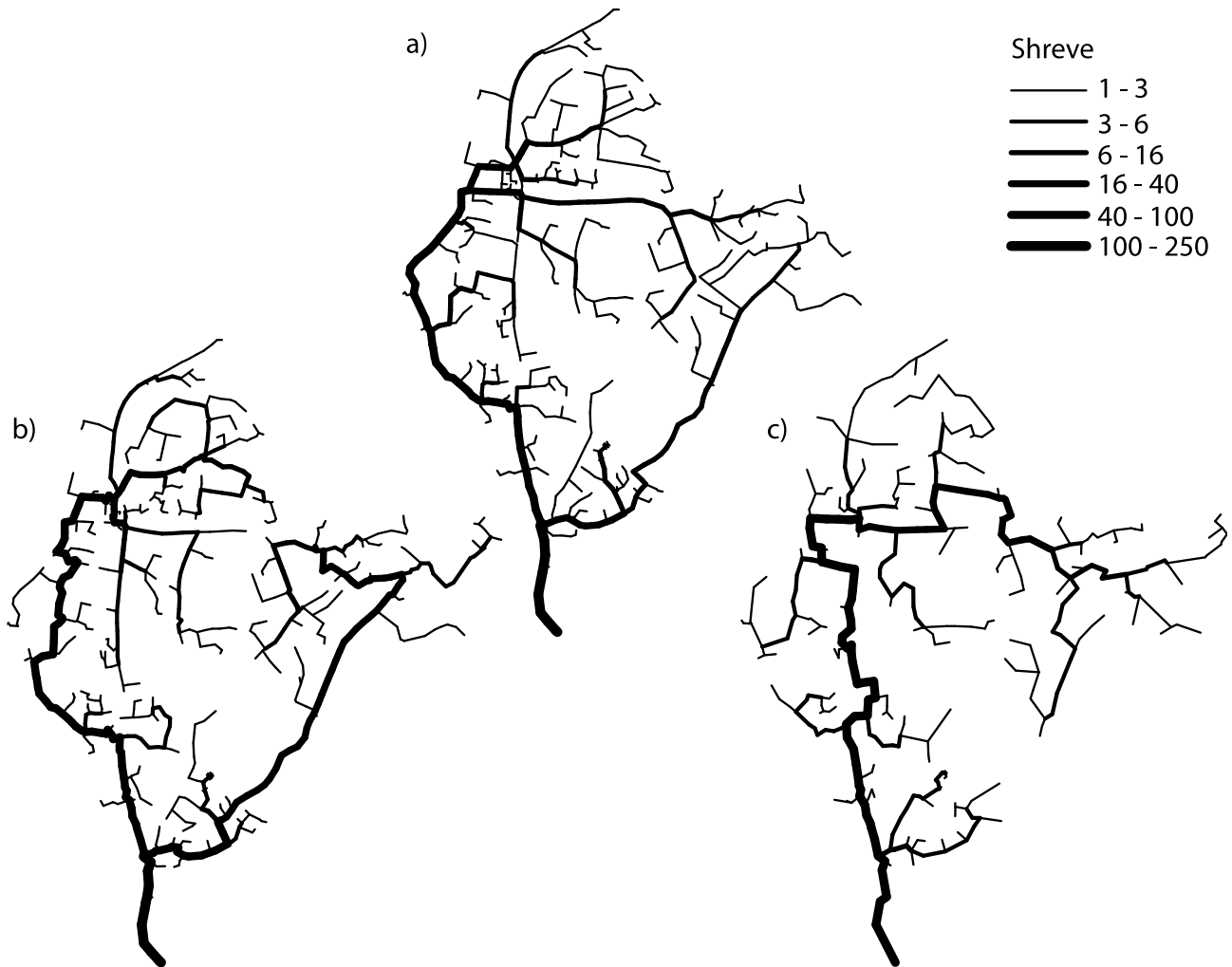
Fig. 1 Comparison between the actual and reconstructed networks using cost function 1 and \alpha=0.9 , \beta=2 and \gamma=5 . a) The actual network; b) The reconstructed network using the entire dataset; c) The reconstructed network using half of the manhole cover locations.

The actual and reconstructed networks (with all and half of the nodes) using the first cost function are presented in Fig.1. The best results are obtained for \alpha \geq 0.7 . This means that distance weights more heavily than elevation when formulated as in Eq.1. When the entire data set is used, the reconstructed and actual networks have similar Shreve stream magnitudes (131 and 125 resp. at the outlet). Based on Heipke et al., (1997), Correctness = 0.89; Completeness = 0.84 and Quality = 0.76 (Tab. 1). These values drop to 0.44, 0.55 and 0.32 respectively when using only half of the nodes and the Shreve stream magnitude at the outlet drops to 84.