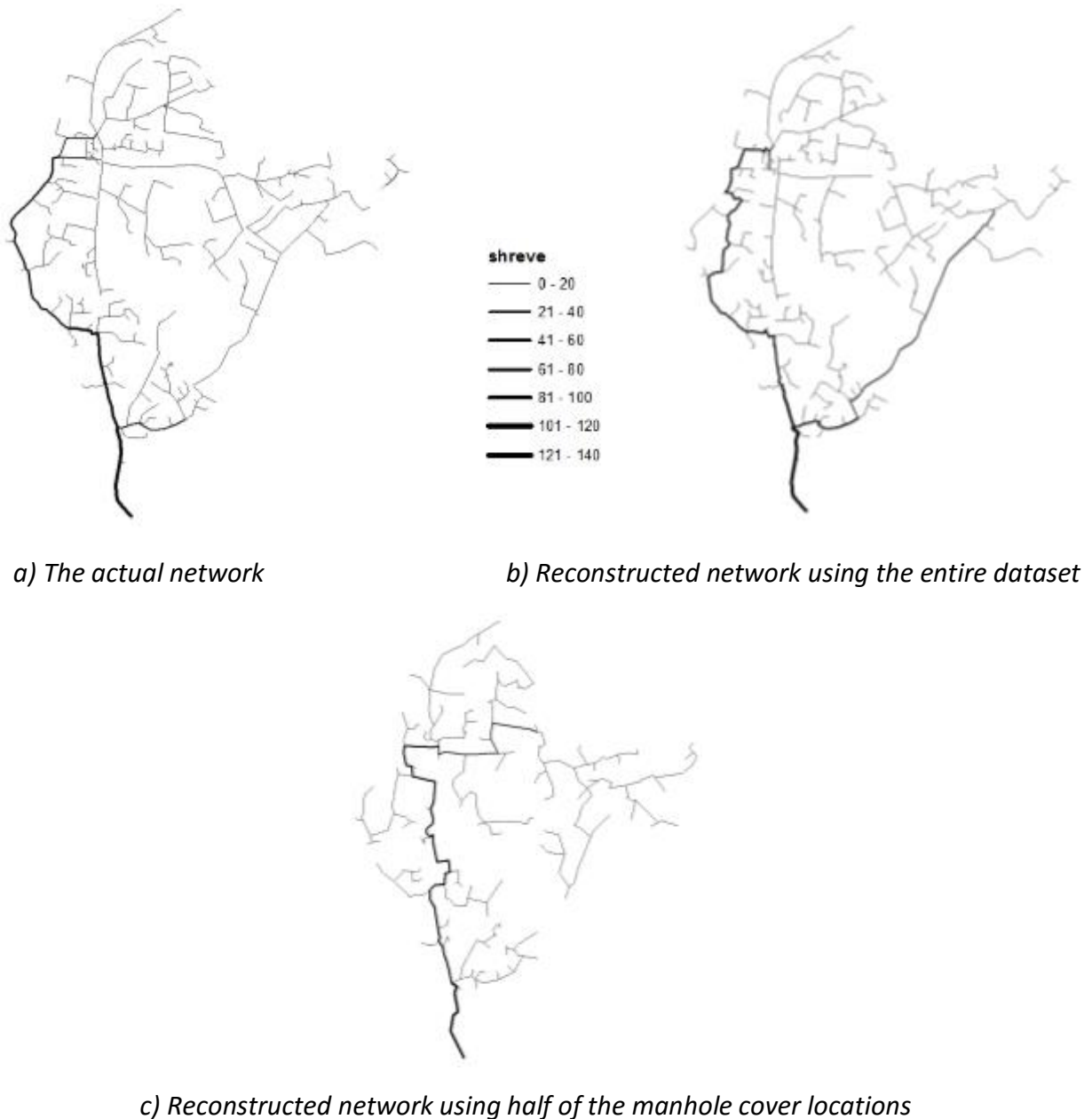
Fig. 1 Comparison between the actual and reconstructed networks using cost function 1 and \alpha=0.9 , \beta=2 and \gamma=5 .

The actual and reconstructed networks (with all and half of the nodes) using the first cost function are presented in Fig.1. The best results are obtained for \alpha \geq 0.7 . This means that distance weights more heavily than elevation when formulated as in Eq.1. When the entire data set is used, the reconstructed and actual networks have similar Shreve stream magnitudes (131 and 125 resp. at the outlet). Based on Heipke et al., (1997), Correctness = 0.89; Completeness = 0.84 and Quality = 0.76 (Tab. 1). These values drop to 0.44, 0.55 and 0.32 respectively when using only half of the nodes and the Shreve stream magnitude at the outlet drops to 84.