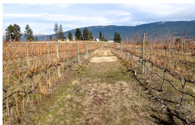
Fig. 1 Examples of common cover cropping strategies and experimentation at the Summerland Research and Development Center, British Columbia. Top : a permanent cover of mixed grass species in a cherry orchard and bottom : a long-term cover crop experiment in wine grapes evaluating mixtures and monocultures of native and introduced grasses

Here, we incorporate ecological knowledge of plant-soil feedbacks into the context of perennial agriculture to explore the use of cover crops to increase microbial diversity and manage crop decline. The specific aims of this review are to (1) synthesize our current understanding of how plant communities influence soil microbial communities into the context of cover crops; (2) highlight key beneficial soil microbes and their role in affecting crop decline; and (3) present plant-based strategies to mitigate decline of perennial crops through soil microbial diversity.