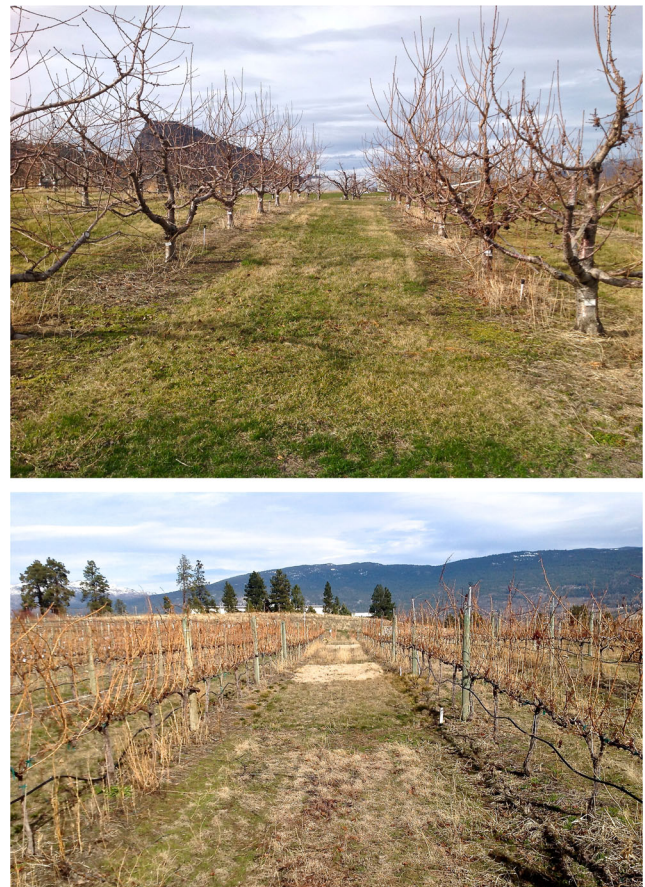
Fig. 1 Examples of common cover cropping strategies and experimentation at the Summerland Research and Development Center, British Columbia. Top : a permanent cover of mixed grass species in a cherry orchard and bottom : a long-term cover crop experiment in wine grapes evaluating mixtures and monocultures of native and introduced grasses

Can growers capitalize on this dilution effect by increasing soil microbial diversity in perennial systems? While many mechanisms contribute to forming soil microbial communities, e.g., abiotic filters (Fierer and Jackson 2006; Lauber et al. 2008), there is an extensive body of literature documenting the ability of plants to “train” their associated microbial communities (Badri and Vivanco 2009; Fanin et al. 2014; Hartmann et al. 2009; Rovira 1969). While growers are limited in their ability to manipulate the diversity of crop plants in their cropping system, cover crop identity and diversity can be an efficient way to increase soil microbial diversity and suppress soil-borne pests that cause crop decline (Garbeva et al. 2004a). Cover crops are already a common feature in many perennial systems (Fig. 1), but their potential impact on the biotic component of soils is often overlooked. For the purpose of this review, we define the term “cover crop” as managed vegetation grown between crop plant rows, including annual and perennial swards.