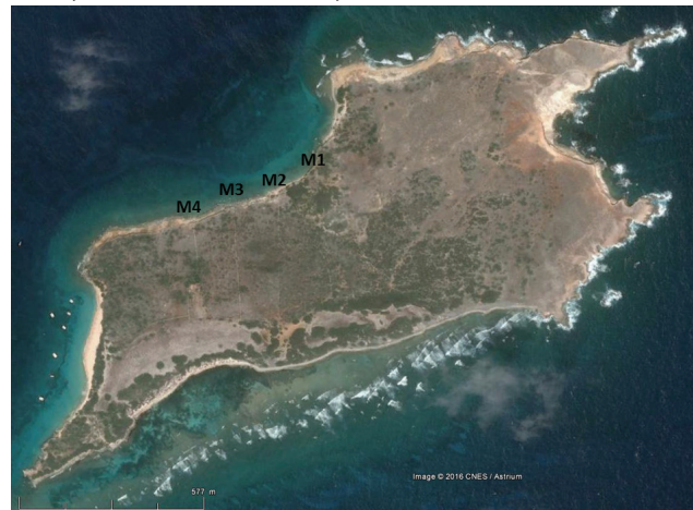
Figure 2. Tintamarre: Google Earth image taken on 2 February 2017 showing the main dry stone walls (M1–4) that provide important habitat for the skinks on the island.

Another survey devoted to skinks (three days) was carried out on Tintamarre in December 2014 and com-