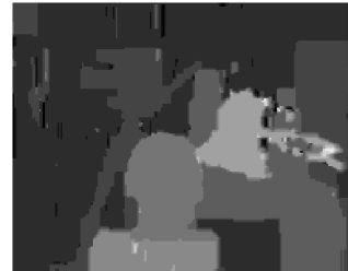
Figure 3. Tsukuba result for quasi-Newton.