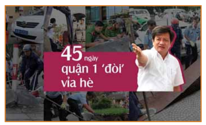
The poster of the official programme "45 days to 'recover' sidewalks in district 1".

This major operation implied poster campaigns, display of force with official announcements and extensive media coverage of strong actions, such as street vendors evictions, building facades and terraces destruction when they encroach on sidewalks, and vehicle impoundments when parked on sidewalks. Such an operation is far from being the first of its kind. Archives from the colonial period contain significant amounts of regulation projects regarding the control of street selling in Saigon. Moreover, in 2008, David Koh undertook the review of the different state campaigns against sidewalk occupation in Hà Nội since the opening reforms of 1986 (Đổi Mới). Between 2013 and 2015, Hồ Chí Minh City, municipal authorities also launched the "civilized streets" programme, which aims at removing street selling in sixteen streets.