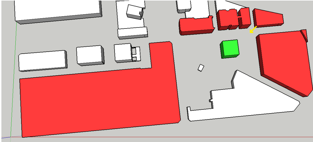
Figure 1. 3D Map of the area, with the new building in green and impacted buildings in red. Green Axis leading north, red axis leading east. The yellow arrow figures the point of view of the Figure 3.