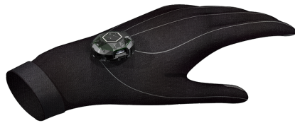
Figure 2: Specktr Pro glove