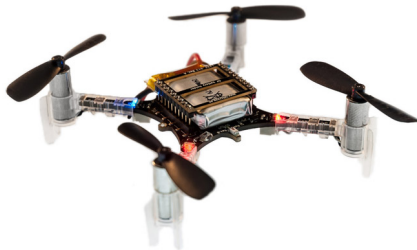
Figure 6: Crazyflie2 drone

juggler movement around the axis X. This way, if he does a vertical movement, such as a traditional juggling throw, the drone will act as a standard ball, but an horizontal throw, for example, will make the drone follow an horizontal curve. (See Figure 5) This way, the artist can, by alternating this trajectory over multiple drones, juggle with them on any arbitrary axis.