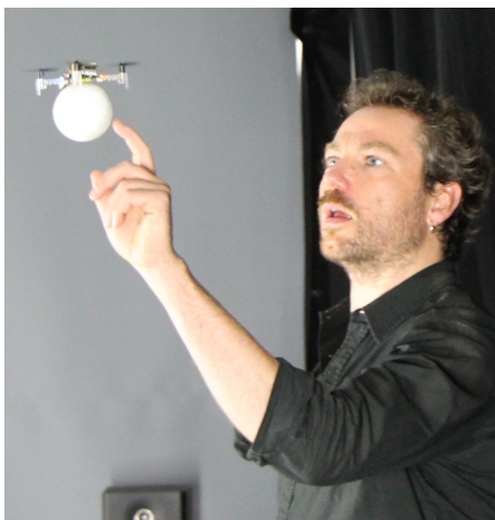
Figure 1: A juggler interacting with a flying ball