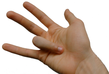
Figure 3: Selecting drone 4