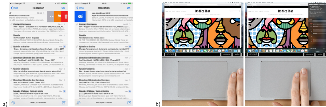
FIGURE 1: Hidden controls. a) Performing an horizontal swipe gesture from the edge of the display in iOS Mail reveals hidden buttons. b) Under macOS X, a two-finger leftward swipe gesture from the right edge of the touchpad reveals the “Notification center”, a hidden information panel disclosed from the right side of the screen.

Nicole Ke Chen Pong Inria Lille Nord-Europe 40 Avenue du Halley 59650, Villeneuve-d'Ascq, France nicole.pong@inria.fr