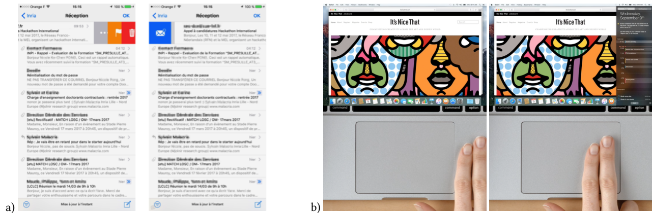
FIGURE 1: Hidden controls. a) Performing an horizontal swipe gesture from the edge of the display in iOS Mail reveals hidden buttons. b) Under macOS X, a two-finger leftward swipe gesture from the right edge of the touchpad reveals the “Notification center”, a hidden information panel disclosed from the right side of the screen.

Nicole Ke Chen Pong Inria Lille Nord-Europe 40 Avenue du Halley 59650, Villeneuve-d'Ascq, France nicole.pong@inria.fr