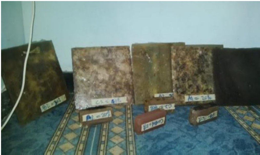
Fig. 4. Developed samples of cochlospermum planchonii reinforced polyester composites.