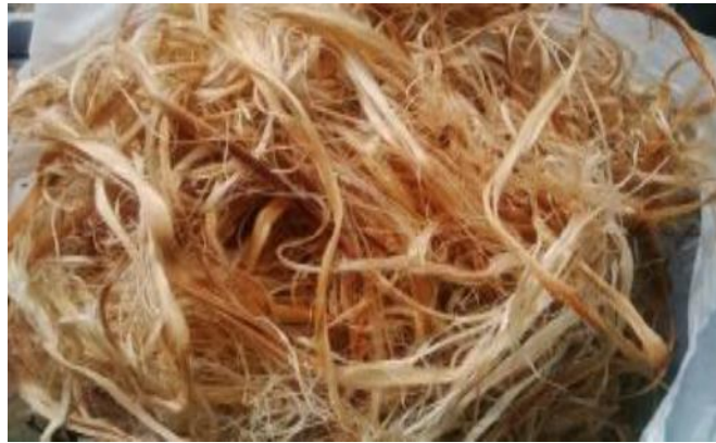
Fig. 2. Treated and dried cochlospermum planchonii fibres.