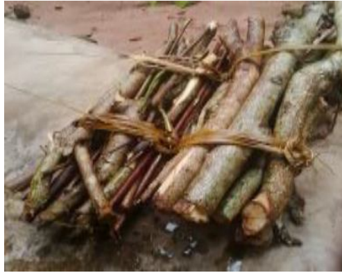
Fig. 1. Cut stems of cochlospermum planchonii fibres.