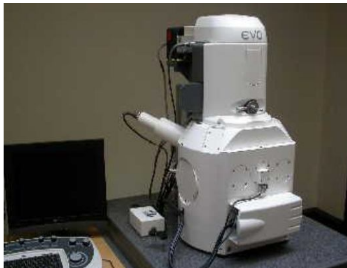
Fig. 3. Scanning electron microscope.