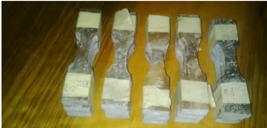
Fig. 5. Test Specimens of cochlospermum planchonii reinforced composite for tensile test.