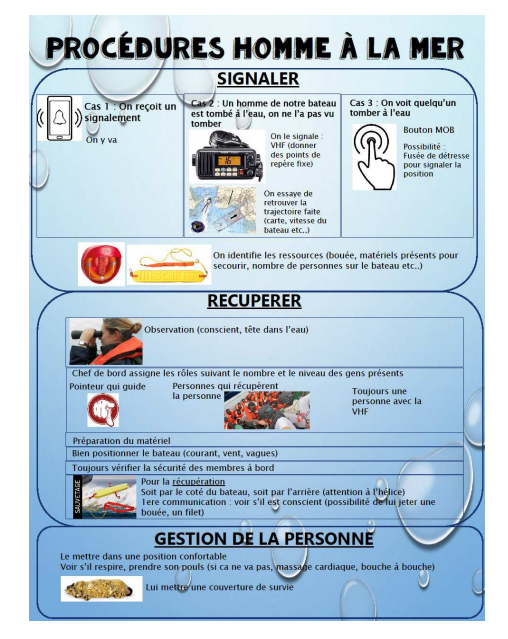
Fig. 2. A MOB rescue protocol, including three phases, proposed by a student team in 2016 (in French).

Unlike the other theoretical frameworks on Reliability (Theory of Normal Accidents, Theory of Crisis...), HRO theoretical frameworks [19, 20] and also the Actionists one [16] are close. They both investigate reliability through human behaviours identified as a source of reliability. Moreover, they both underline flexibility in the decision-making process. For such, Weick identifies three characteristics of the HRO: (i) information overload, (ii) constant turbulence, (iii) increasing complexity. These characteristics are opportunities to activate a sense making process. They were used as theoretical foundations to implement the rescue scenarios during the outdoor sessions of the breadth course presented above.