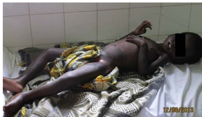
Fig. 1. Children with kwashiorkor. Note the skin changes and edema.

The importance of applying a mix of clinical and anthropometric methods to assess malnutrition has recently been emphasized [6]. Marasmus is a wasting syndrome without specific symptoms. Conversely, kwashiorkor is well-described and represents a form of severe malnutrition [4] in which anthropometric parameters are useless in relation to edema (Fig. 1). Kwashiorkor was first described in 1933 by an exceptional physician, Dr. Cicely D. Williams, and is the local term in the Gold Coast meaning 'the disease the deposed baby gets when the next one is born' [7,8]. Symptoms appear four to twelve months after the onset of defective feeding, while the patient develops normally. Irritability then begins, with attacks of diarrhea and swelling of the hands and feet. Seven to ten days later, changes to the skin begin to take place, including