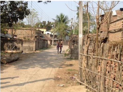
Bangitola 13, Akunda bariya

100 % of the households have been displaced : they came to these villages after being affected by riverbank erosion.