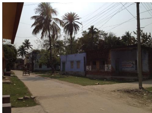
Bangitola, Bangitola 10

A mixed village (affected and non-affected households) - some lands have been given to some displaced people