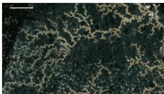
Figure 1. Optical micrograph (Nikon, Plan Fluor) of a fixed bacterial biofilm on a \text{Si}_3\text{N}_4 window. Magnification is 400\times . Scale bar is 50\ \mu\text{m} .

Gram-negative, aerobic rod bacteria Pseudomonas aeruginosa (environmental isolate) were selected as the representatives of the most-studied single species to form biofilms on substrates (Fig.1). A standard electron microscopy sample support, namely silicon nitride membranes ( \text{Si}_3\text{N}_4 ) was chosen as substrate on which the bacteria were cultured in BM2 mineral medium (62 mM potassium phosphate buffer (pH 7), 7 mM (\text{NH}_4)_2\text{SO}_4 , 2 mM \text{MgSO}_4 , 10 \mu\text{M} \text{FeSO}_4 , 0.4% (wt/vol) glucose) for 48 h. Planktonic, non adherent bacteria were removed by washing with phosphate buffered saline (pH 7.5) and subsequently the biofilms were fixed with 2.5 % glutaraldehyde solution for 1 h.