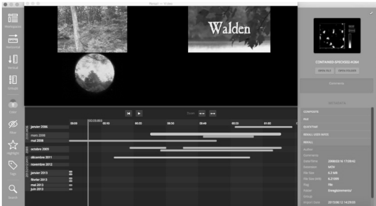
Figure 2. Rekall. Timeline workspace

notation and annotation feature: it allows the notation of the different cue lists set up by the technical teams (the lighting technician, the sound technician, and so on), providing an overview of all the technical ‘scores’ involved in the show; and it allows researchers or directors to annotate the video using text.