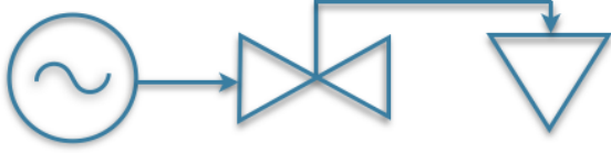
Fig. 3: The machine learning processing pipeline scheme from left to right: the EEG input source, the auto-encoder, and the classifier.

to the analysis of time series, which allows us to extract useful patterns (essence) from the analyzed EEG signal records and classify it later. Our idea is to create advanced machine learning classification pipeline, where the input EEG data is processed in two stages (see Figure 3):