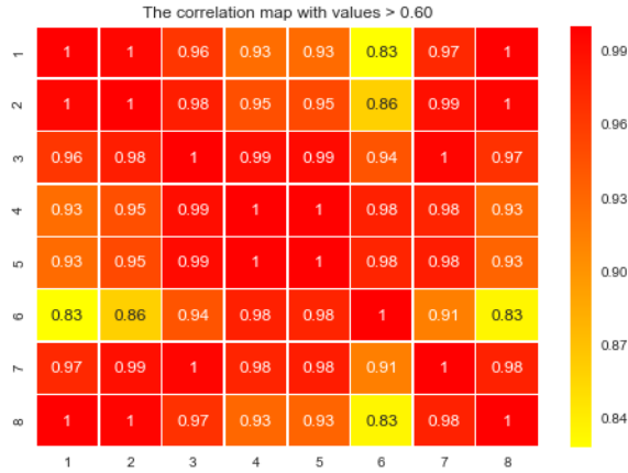
Fig. 4: The heat map with correlation coefficients between eight recording sessions for one of the experiment participants. It can be seen that majority of sessions highly correlate with each other and only session #6 is a bit outlier. Such high correlation values is a good sign that applied configuration of the visual stimuli is optimal to elicit robust SSVEP response which can be compressed to extract useful pattern (encoding).