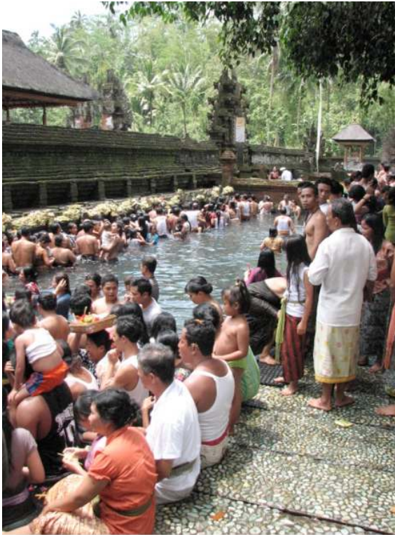
Illustration 3. Purification ritual ceremony for the Full Moon celebration, at Pura Tampak Siring