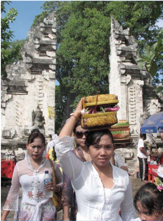
A BALINESE WOMAN CARRYING FLOWERS AND FRUIT OFFERINGS, WITH RICE STUCK TO HER FOREHEAD AS A SIGN OF PURIFICATION.