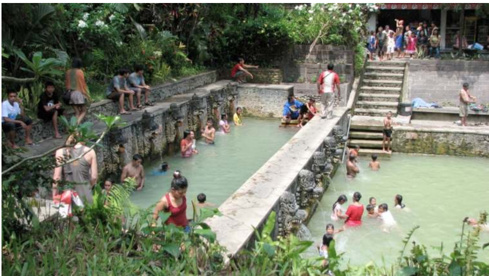
Illustration 4. Balinese enjoying hot springs for leisure but also spiritual values in Air Panas Banjar