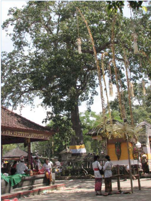
Illustration 5. The quest for “harmony” with nature

The quest for “harmony” with nature in ceremonies is shown by: dressing sacred trees, setting up Penjors made from high bamboos decorated with flowers, fruit and roots, and offerings of fruit and flowers.