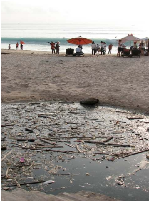
Illustration 6. Dreamland Beach

THE ENTRANCE TO DREAMLAND BEACH DESTROYS THE IMAGE OF “DREAMLAND” FOR WESTERN TOURISTS BY THE SIGHT OF STAGNANT WATER WHICH IS OFTEN HIGHLY POLLUTED. IT DOES NOT PARTICULARLY SEEM TO WORRY THE DOMESTIC TOURISTS, WHO ARE ENJOYING THE BEACH IN THE BACKGROUND.