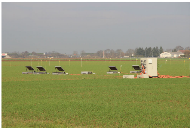
Fig. 1 Partial view of the experimental design equipped with automated static chambers, each of which has a 98-L headspace and equipped with an air temperature sensor and a fan to homogenize the atmosphere during the measurement. The chambers are connected to a waterproof cabinet containing the N 2 O gas analyzer, the datalogger to record soil moisture and temperature, headspace temperature, and data from the analyzer. It also contains the automated screening system that controls the opening and closing of the chambers and starts/stops the fan inside each chamber

kilograms of N per hectare per day. r_{max} , revealing the capacity of the soil to reduce N 2 O, is the maximum ratio of accumulated N 2 O to denitrified nitrate under anaerobic conditions; D_p is the potential denitrification rate (also in kg N ha -1 day -1 ); F_N , F_w , and F_T are response functions for soil nitrate content, water-filled pore space, and temperature, respectively (Hénault and Germon 2000); z is the proportion of nitrified nitrogen emitted as N 2 O; and N_w , N_{NH_4} , and N_T are response functions for soil water content, ammonium content, and temperature, respectively.