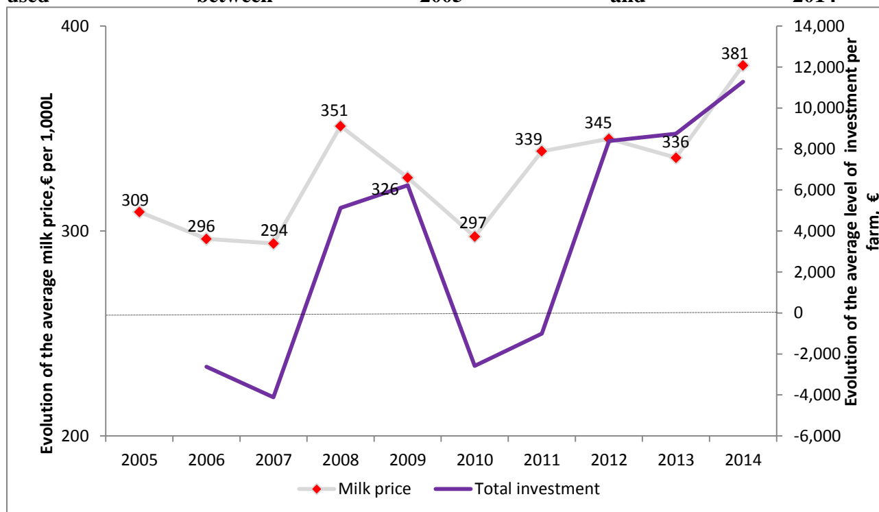
Figure 1: Evolution of the average level of investment and milk price for the sample used between 2005 and 2014