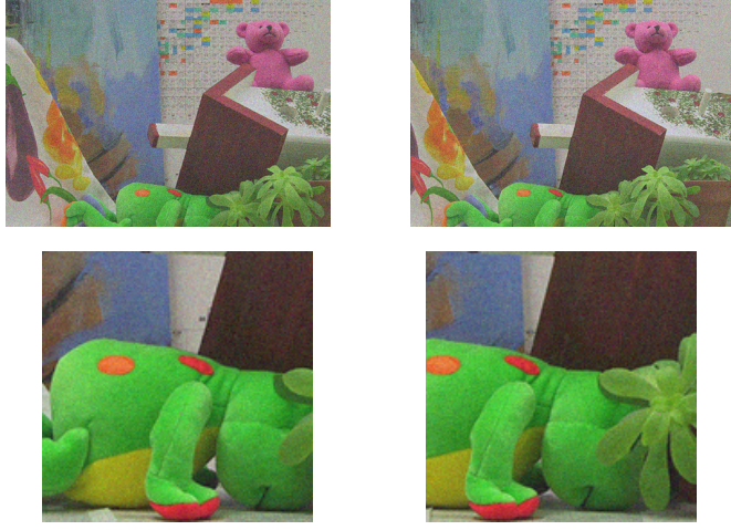
Fig. 1. First row: left and right images \mathbf{y}^L and \mathbf{y}^R used for the depth estimation experiment. Second row: zoom in on the same part of these two images, to show the horizontal shift and the presence of noise.

iterations of the proposed method with \tau = 0.005 . We can observe that with the full splitting and intermediate splitting, the constraints take time to be satisfied, whereas with the proposed minimal splitting, the constraint is satisfied at every iteration. For all three methods, the value \tau = 0.005 yields the fastest convergence.