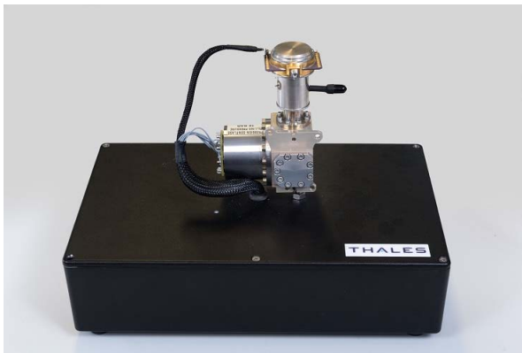
Fig 2 Compact cryogenic system for UHF filter

This process has to take into account many constraints (static vacuum, thermal losses, AC/DC feedthrough, lifetime,...). A standalone compact cryogenic system for RF filter has already been developed by Thales (Fig 2). We are now working to standardize the design and make it compatible with HTS oscillators.