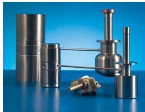
Fig 1 Thales Cryogenics coolers

HTS devices working temperature (between 60 K and 80 K) is reached and sustained by a cryogenic cooler. It seems difficult to develop from scratch specific cryogenic coolers for each use case. A better idea would consist in re-using coolers employed with infrared sensors as these devices have already shown their performances in terms of reliability and compactness.